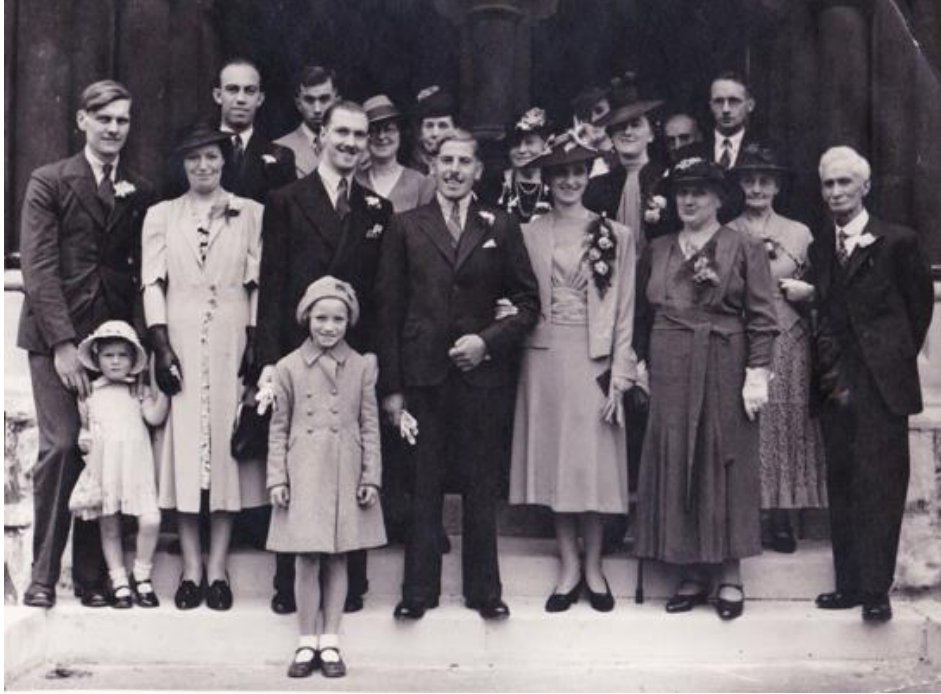
Wedding photo. June 15, 1940.